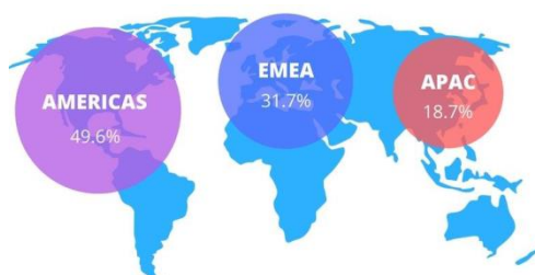
Global market for cardiac biomarkers

Global market for cardiac biomarkers is $ 4.81 billion (Technavio, 2016). It is estimated that it will grow at an annual composite rate close to 18% during the 2016-2024 period, reaching $ 13.3 billion in the year 2024, according to a report by Grand View Research, 2016.